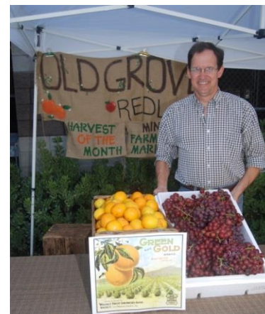
Old Grove Orange