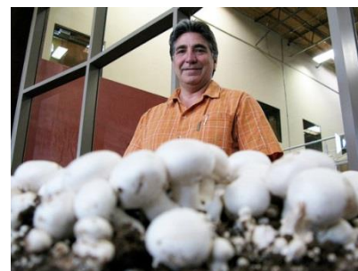
Mountain Meadow Mushrooms