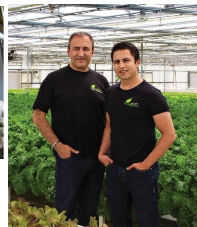
Go Green Agriculture